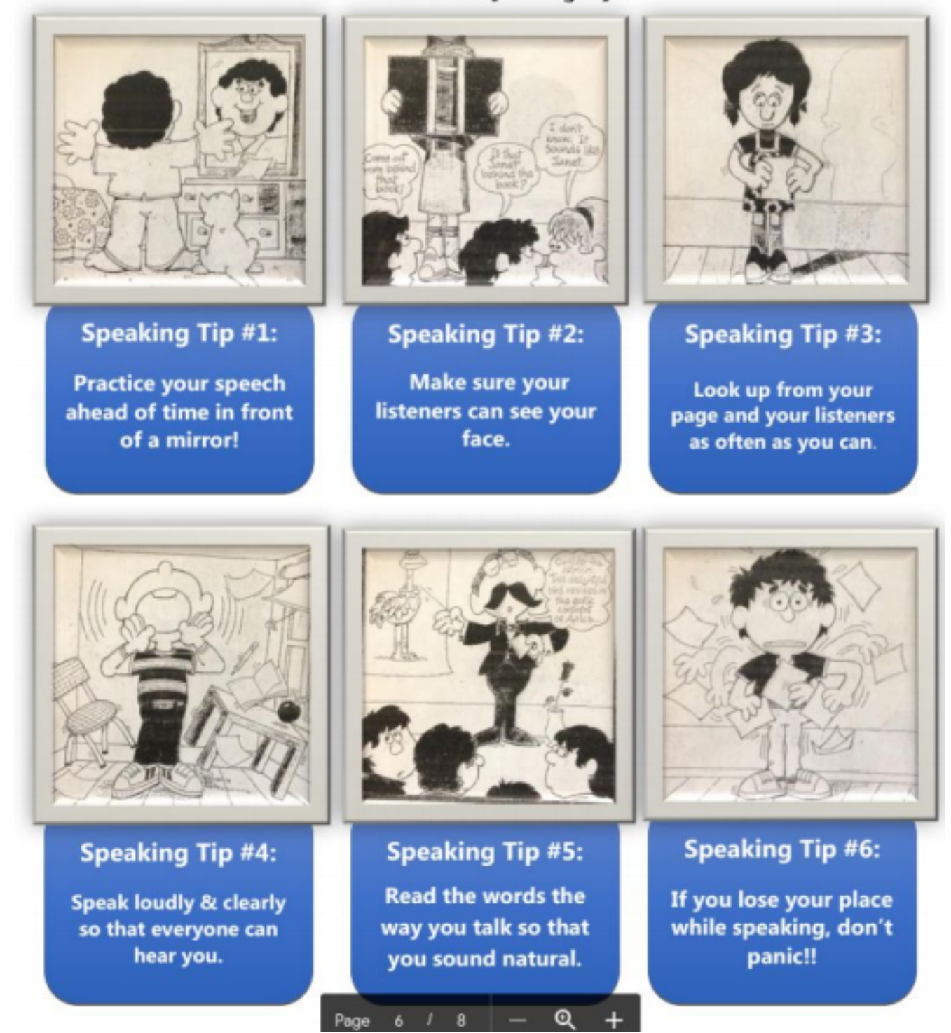
Public Speaking Tips